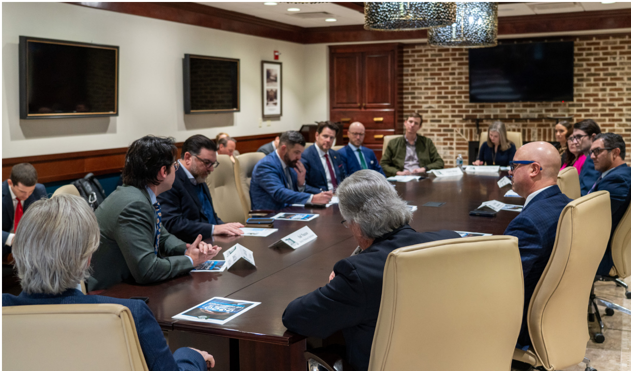
The FAIF Lunch & Learn Series was hosted by the Florida Restaurant and Lodging Association in Tallahassee.

This document captures the key points and areas of discussion held at an FAIF roundtable event on 'Artificial Intelligence and Its Impact on the Business Community'. It is our hope that this document will provide a comprehensive introduction to all, and that the discussions among Florida's employers and our government leaders continue on this important subject.