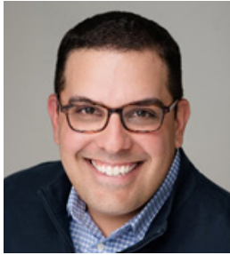
Chair of Foundation