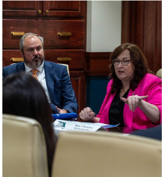
Rep. Christine Hunschofsky (D-Coconut Creek) and Sen. Joe Gruters (R-Sarasota) were great participants in the discussion.

Nuzzo echoed Rep. Hunschofsky's concerns for the lack of education about AI and how movies and tv shows guide many Americans' views about AI in general. Nuzzo suggested that regulators should be mindful when crafting their approach to overseeing the use of AI and they should not enact policies that will negatively impact AI's usefulness 5 years from now.